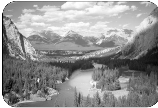
Banff with Lake Louise, Alberta, Canada

You can give the following prayer to be taken at night in your soul consciousness to Archangel Michael's home in the heaven-world.